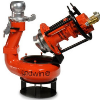
Please contact the factory or office for further details. A typical picture of the pump is shown. All information is approximate and for general guidance only.

The Godwin Heidra 100NC hydraulic submersible pump is a compact self-contained pumping unit featuring a diesel driven power pack and 4" hydraulic pump end. With variable speed diesel engine power, the Heidra 100NC offers flow rates to 1030 USGPM.